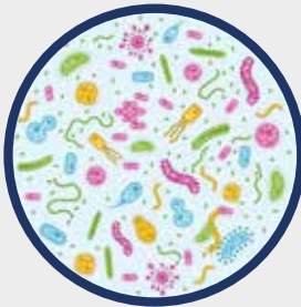
Collection of Probiotic Bacteria from a variety of sources

From Nature to ready to use effective, sustainable, and ecologic topical probiotics